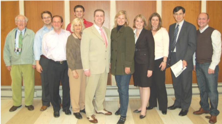
National policy convention delegates were excited to visit Winnipeg in November.

electoral district associations from across Canada were invited to attend and to send 10 voting delegates to the Convention. St. Paul's held a delegate selection meeting in May where our local members elected our representatives. Each member of the St. Paul's delegation participated in important policy votes and discussions groups.